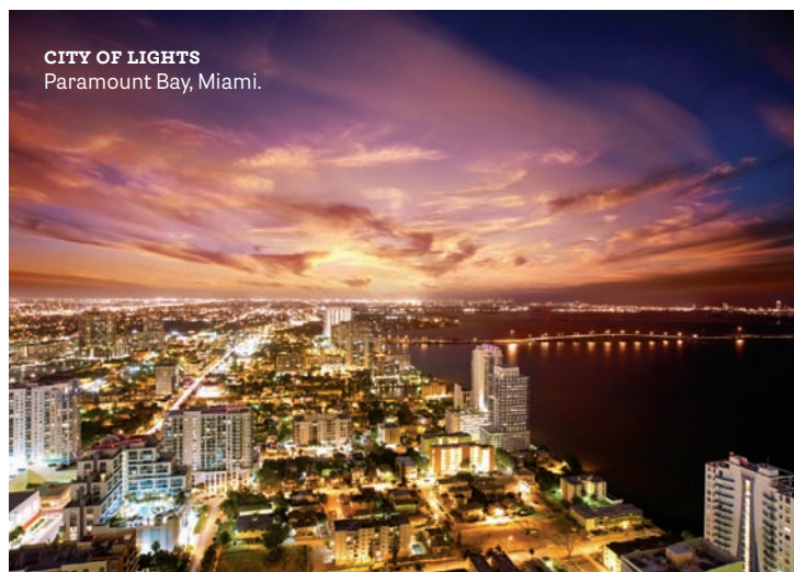
CITY OF LIGHTS Paramount Bay, Miami.