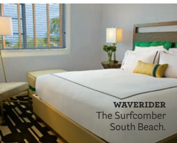
WAVERIDER The Surfcomber South Beach.

or under the age of 18 and include everything from sports facilities to a library lounge. There are five two-bedroom floor plans to choose from among the three-season cottages. The last phase of cottage construction is currently underway. The newest phase broke ground in August 2011 for a limited number of four-season cottages, consisting of six floor plans of approximately 640 square feet. Pricing from $180,000. seaglassvillage.com .