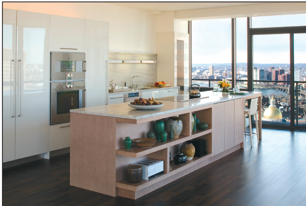
The chef's kitchen features top-of-the-line Gaggenau appliances and custom cabinetry.

On the 31st floor just outside the elevator