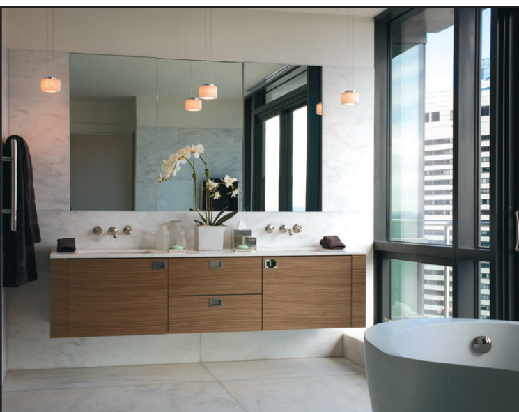
The master bath is sumptuous with a freestanding soaking tub and a glass-enclosed steam shower.

Between the two bedrooms is a conveniently located laundry room with a stacked steam Electrolux washer and dryer.