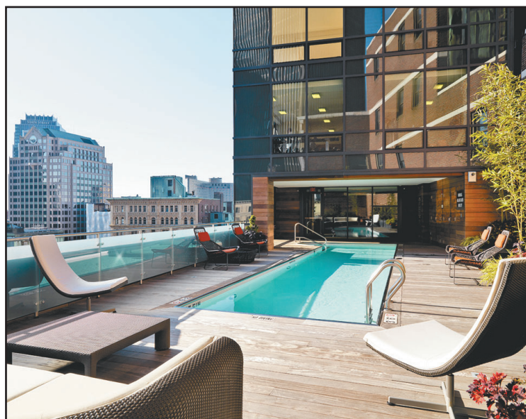
A four-season pool and a fitness center managed by Exhale are among the five-star amenities at 45 Province.